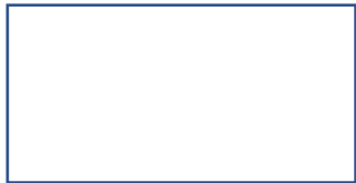
Left Thumb Impression